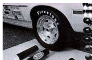
Driver slowly inches car forward until the second light beam is broken and the "Staged" lights come on.