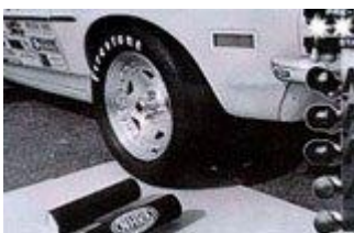
As a vehicle approaches the starting line it breaks the first light beam and the "Pre-Stage" light on 'Christmas Tree' is lit.

In basic terms, a drag race is an acceleration contest from a standing start between two vehicles over a measured distance at a specifically designed drag race facility. The accepted standard for that distance is either a quarter-mile or an eighth-mile. These contests are started by means of an electronic device commonly called a "Christmas Tree." Upon leaving the starting line, each contestant activates a timer which is, in turn, stopped when the same vehicle reaches the finish line. The start-to-finish clocking is the vehicle's E.T. (elapsed time), which serves to measure performance and often serves to determine handicaps during competition.